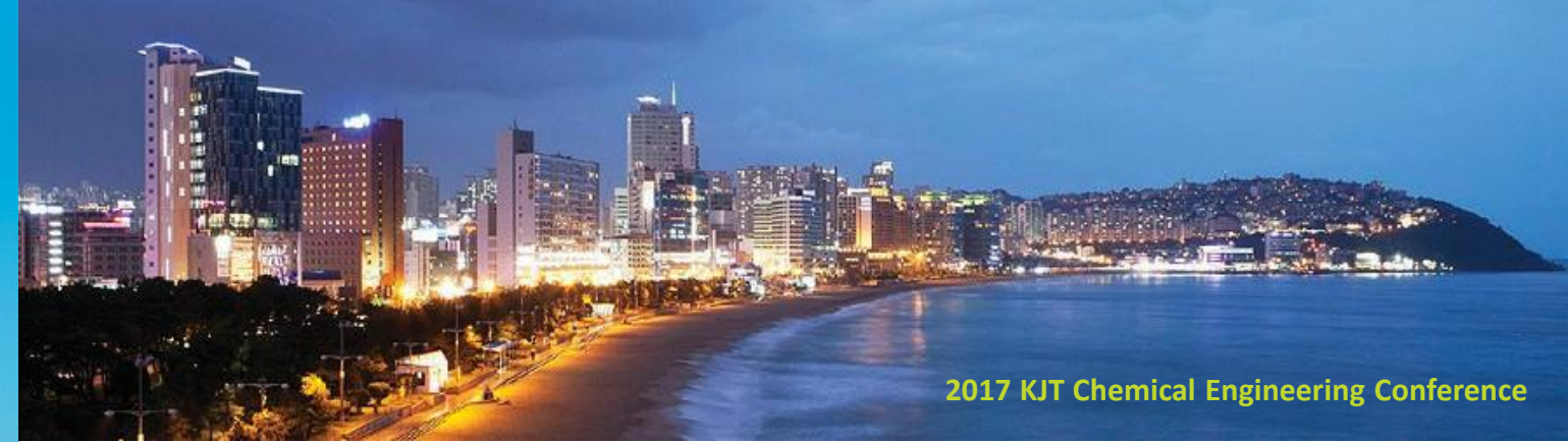
2017 KJT Chemical Engineering Conference

Conference Location: Haeundae Grand Hotel Haeundae-Beach Road 217, Haeundae-gu, Busan http://www.haeundaegrandhotel.com